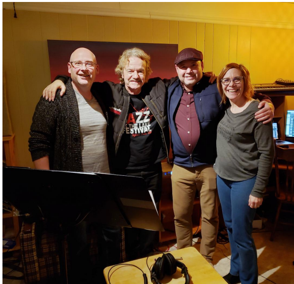
Recording session in Saskatchewan