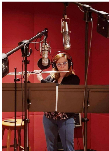
Recording session in Québec