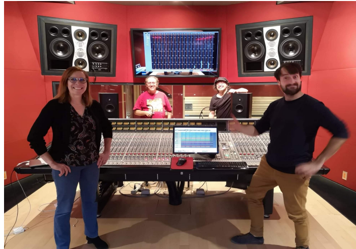
Recording session in Québec